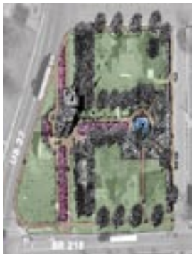
Aerial view of Muensterberg Plaza

The Newsletter of the the Berne Community Development Corporation