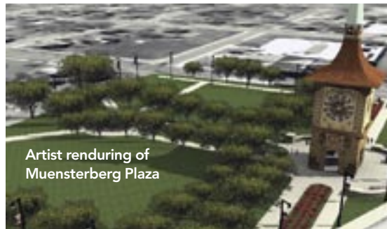
Artist rendering of Muensterberg Plaza

In the spring of 2003, the Berne Community Development Corporation (CDC) hired Moake Park, an architectural firm from Fort Wayne. Moake Park's assignment was to prepare preliminary plans for streetscaping along the Main Street and US 27 business corridors, as well as to show how new Swiss facades could improve these business areas to foster increased tourism. The goal was to help our business districts encourage individuals to stroll, shop and do business.